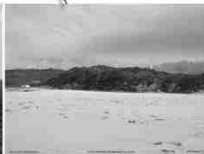
Inlet mouth looking south. Distance 1.4km. GPS coordinates: zone 50, 530 256 mE, 612 3937 mN