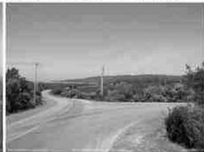
Prawn Rock Channel looking south. Distance 1.5km. GPS coordinates: zone 50, 532 791 mE, 612 4167 mN