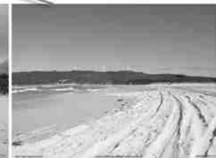
First Reef looking southwest. Distance 1.9km GPS coordinates: zone 50, 530 660 mE, 612 4350 mN