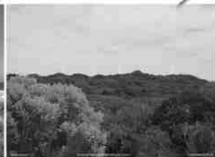
Lions Lookout looking west. Distance 500m. GPS coordinates: zone 50, 530 153 mE, 612 3963 mN