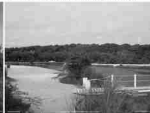
Poison Point looking southwest. Distance 6km. GPS coordinates: zone 50, 532 393 mE, 612 6151 mN