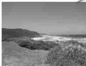
Lights Beach carpark looking east. Distance 4.3km GPS coordinates: zone 50, 525 167 mE, 612 4442 mN